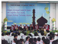
Halal Bi Halal