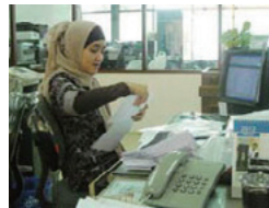
Female employees wearing headscarves