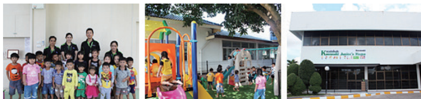
The nursery of Kawasaki Motors Enterprise (Thailand) Co., Ltd.

In Japan, meanwhile, we provide nursery facilities at the workplace on supplementary work days to offer childcare for limited periods.