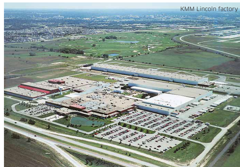
KMM Lincoln factory

The Lincoln factory began its operation with the production of motorcycles in 1974, as a factory of Kawasaki Motors Corp., U.S.A. (and thereafter came under the control of KMM in 1981, when KMM was founded). The factory currently produces, among others, all-terrain vehicles, the Jet Ski *1 personal watercraft, and railway vehicles. The factory has introduced the Kawasaki Production Systems (KPS) *2 , Kawasaki's original production systems developed through mass-production activities over many years. It will extend these systems to the production of aerostructures as well.