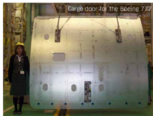
Cargo door for the Boeing 777

*1 Jet Ski is a registered trademark of Kawasaki.