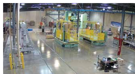
Boeing 777X cargo door production line

Kawasaki Group company NIPPI Corporation received a Boeing's 2016 Supplier of the Year Awards (the Collaboration Award) in April. The award received by Nippi from the company this time follows its receipt of Boeing's President's Award for Excellence in 1998.