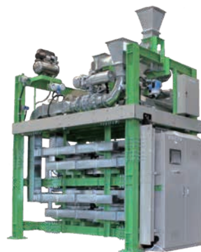
New ventilation system using a gas-permeable membrane (Demonstration machine)